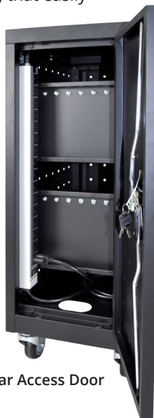
Rear Access Door